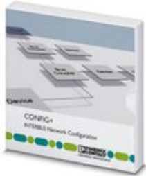
Config+ full version for configuration and diagnostics of an INTERBUS system

Please be informed that the data shown in this PDF Document is generated from our Online Catalog. Please find the complete data in the user's documentation. Our General Terms of Use for Downloads are valid ( http://phoenixcontact.com/download )